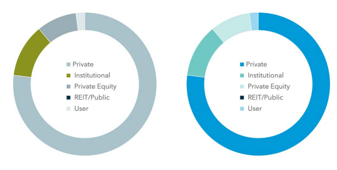
SALE BY SELLER TYPE

**'Sale by Buyer' and 'Sale by Seller' Data is comprised of data from the previous 12 months.