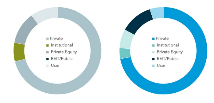
SALE BY SELLER TYPE