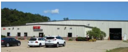
191,000 SF 215 N Hill Brady Battle Creek, MI