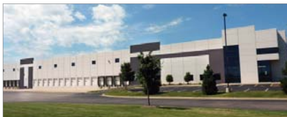
312,750 SF 501 Steward Rd. Rochelle, IL