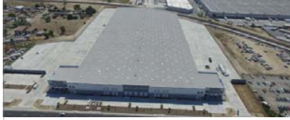
414,020 SF 2255 S. Waterman Ave. San Bernardino, CA