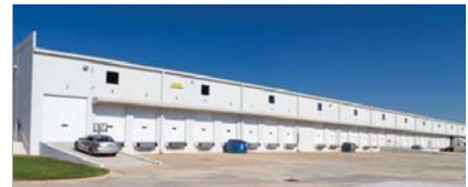
172,640 SF 5356 Georgia Hwy 85 Atlanta, GA