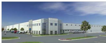
362,670 SF 5180 N. Railhead Rd. Fort Worth, TX