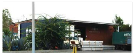
199,069 SF 2020 & 2032 E. 220th Carson, CA