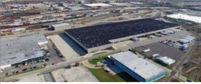
408,908 SF 5100 West 70th Place Bedford Park, IL