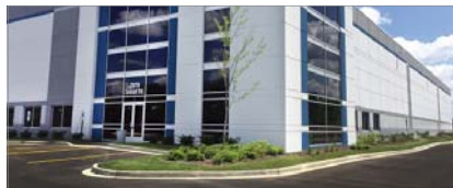
485,850 SF 7879 Lemont Rd. Darien, IL