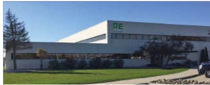
106,000 SF 17500 Twenty Three Mile Rd. Macomb Township, MI