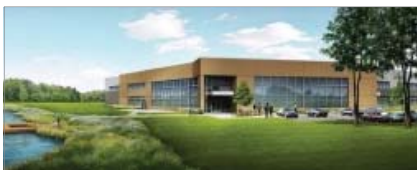
86,900 SF 28355 Lakeview Lyon Township, MI