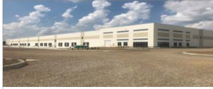
322,000 SF 3265 Southpark Place Grove City, OH