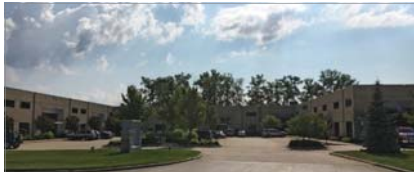
151,600 SF Danview Technology Ct. Shelby Township, MI