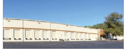
200,500 SF 7405 Graham Rd. Fairburn, GA