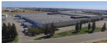
417,600 SF 17100 S. Harlan Rd. Lathrop, CA