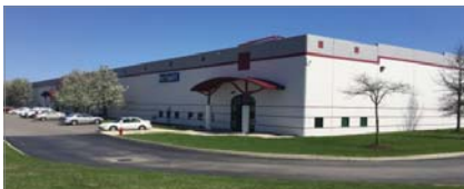
190,400 SF 5701 Meadows Dr. Grove City, OH