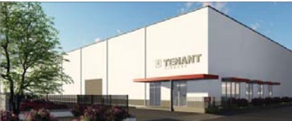
110,710 SF 225 South 51st St. Phoenix, AZ