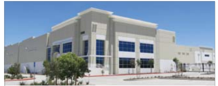
771,839 SF 1300 California Ave. Redlands, CA