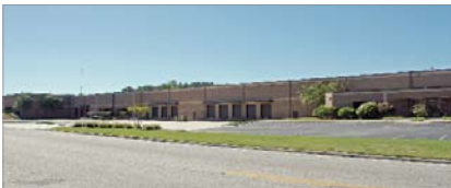
159,332 SF 1235 Commerce Rd. Morrow, GA