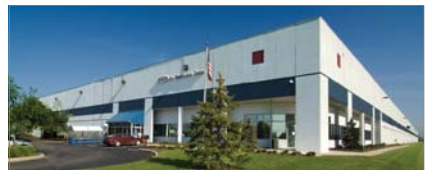
516,174 SF 2235 Spiegel Dr. Groveport, OH