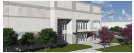
424,280 SF 2800 S. Millers Ferry Rd. Wilmer, TX