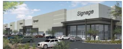
96,320 SF SW Corner of Presidio & Greenfield Mesa, AZ