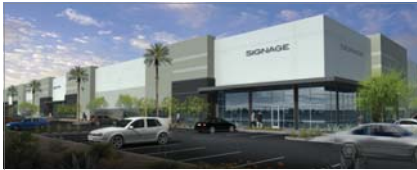
121,295 SF E of NEC Arizona Ave. & Palomino Chandler, AZ