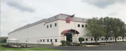
269,831 SF 5900 Meadows Dr. Grove City, OH