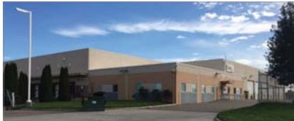
143,888 SF 4730 Fite Ct Stockton, CA