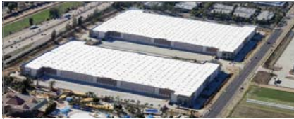
1,101,889 SF 2185, 2255 W. Lugonia Ave. Redlands, CA