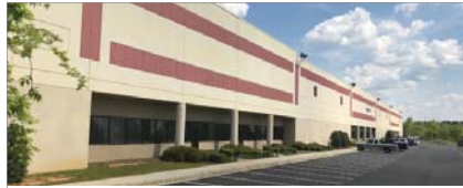
120,000 SF 1385 Valentine Industrial Parkway Pendergrass, GA