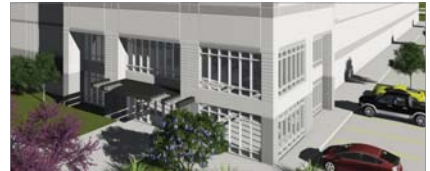
203,656 SF 2700 S. Millers Ferry Rd. Wilmer, TX