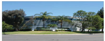
73,062 SF 17150 Margay Ave. Carson, CA