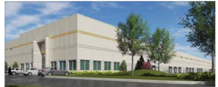
421,405 SF Brewster Creek Blvd. Bartlett, IL