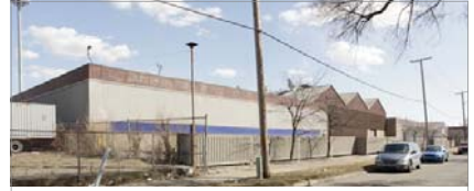
132,601 SF 6455 Kinsley St. Dearborn, MI