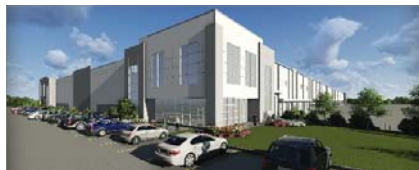
135,200 SF Southside Industrial Parkway Hapeville, GA