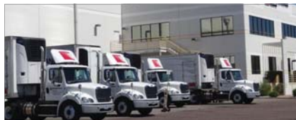
90,552 SF 9310 S. McKemy St. Tempe, AZ