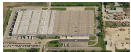
295,620 SF 2001 Baseline Dr. Montgomery, AL