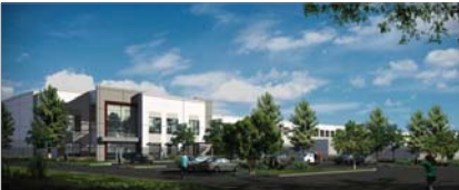
329,000 SF Santa Anita Ave. Cucamonga, CA