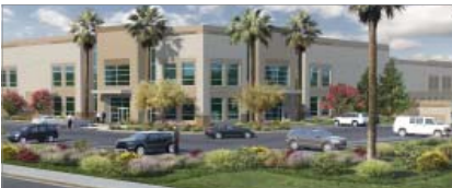
549,805 SF Waterman Dist. Center San Bernadino, CA